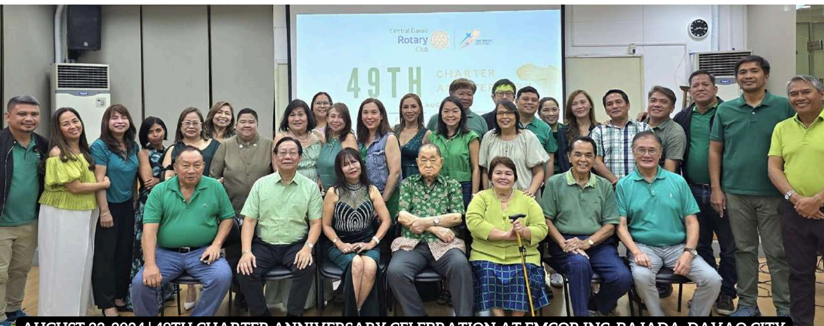
AUGUST 23, 2024 | 49TH CHARTER ANNIVERSARY CELEBRATION AT EMCOR INC, BAJADA, DAVAO CITY