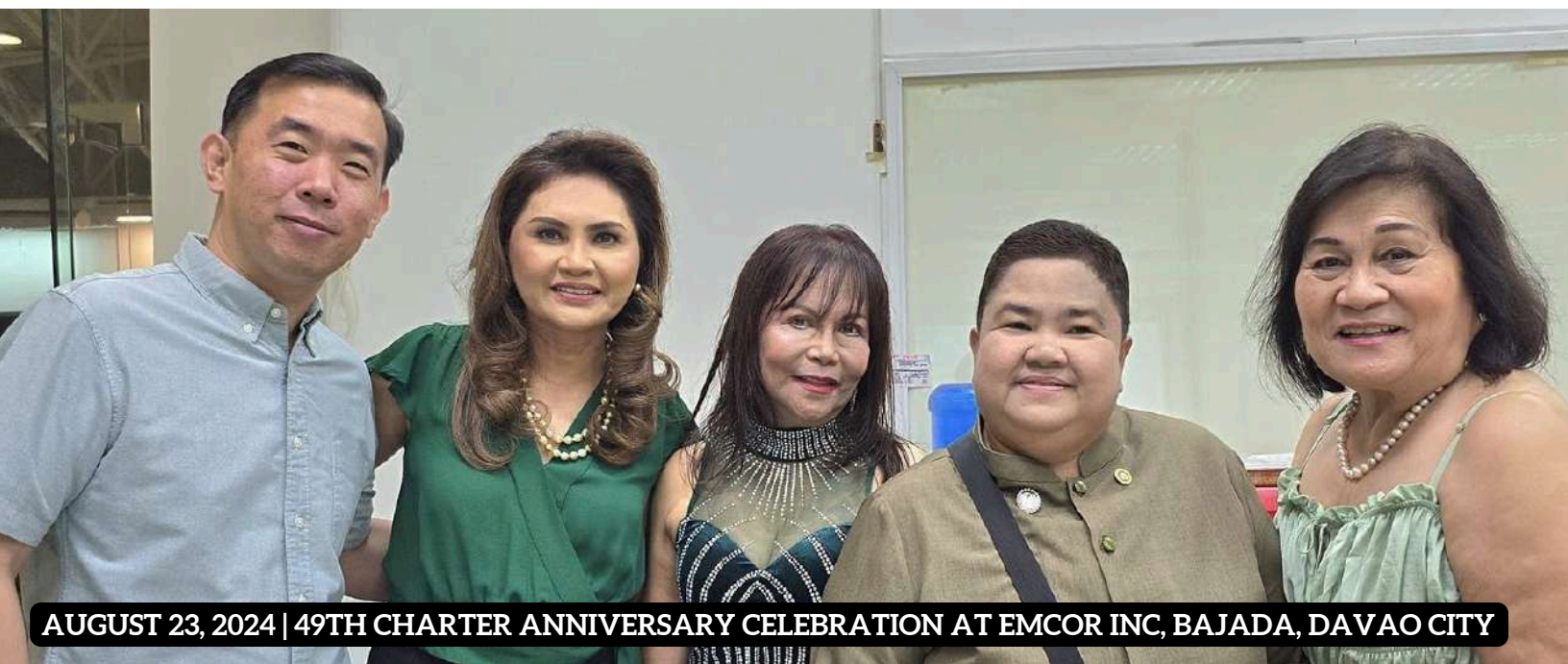
AUGUST 23, 2024 | 49TH CHARTER ANNIVERSARY CELEBRATION AT EMCOR INC, BAJADA, DAVAO CITY