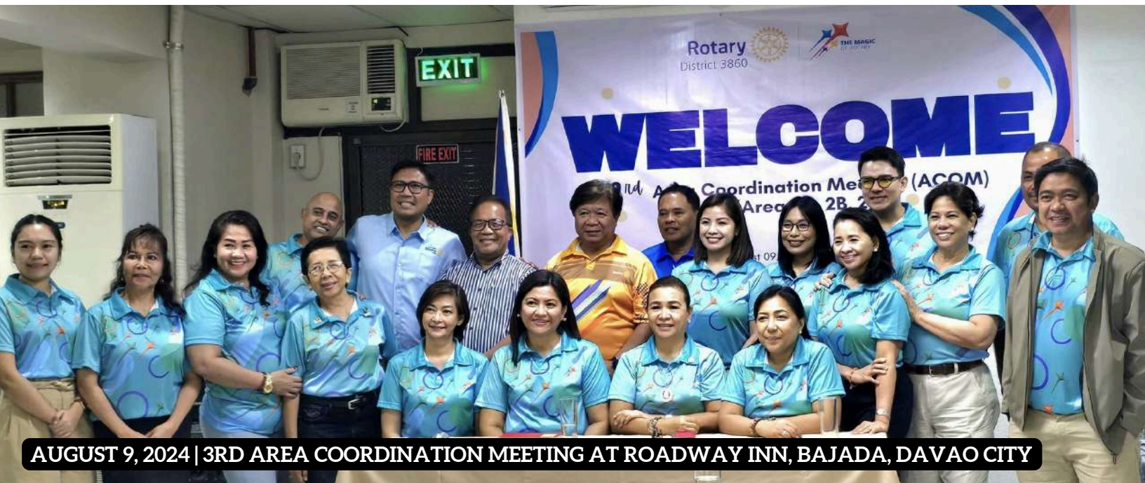
AUGUST 9, 2024 | 3RD AREA COORDINATION MEETING AT ROADWAY INN, BAJADA, DAVAO CITY